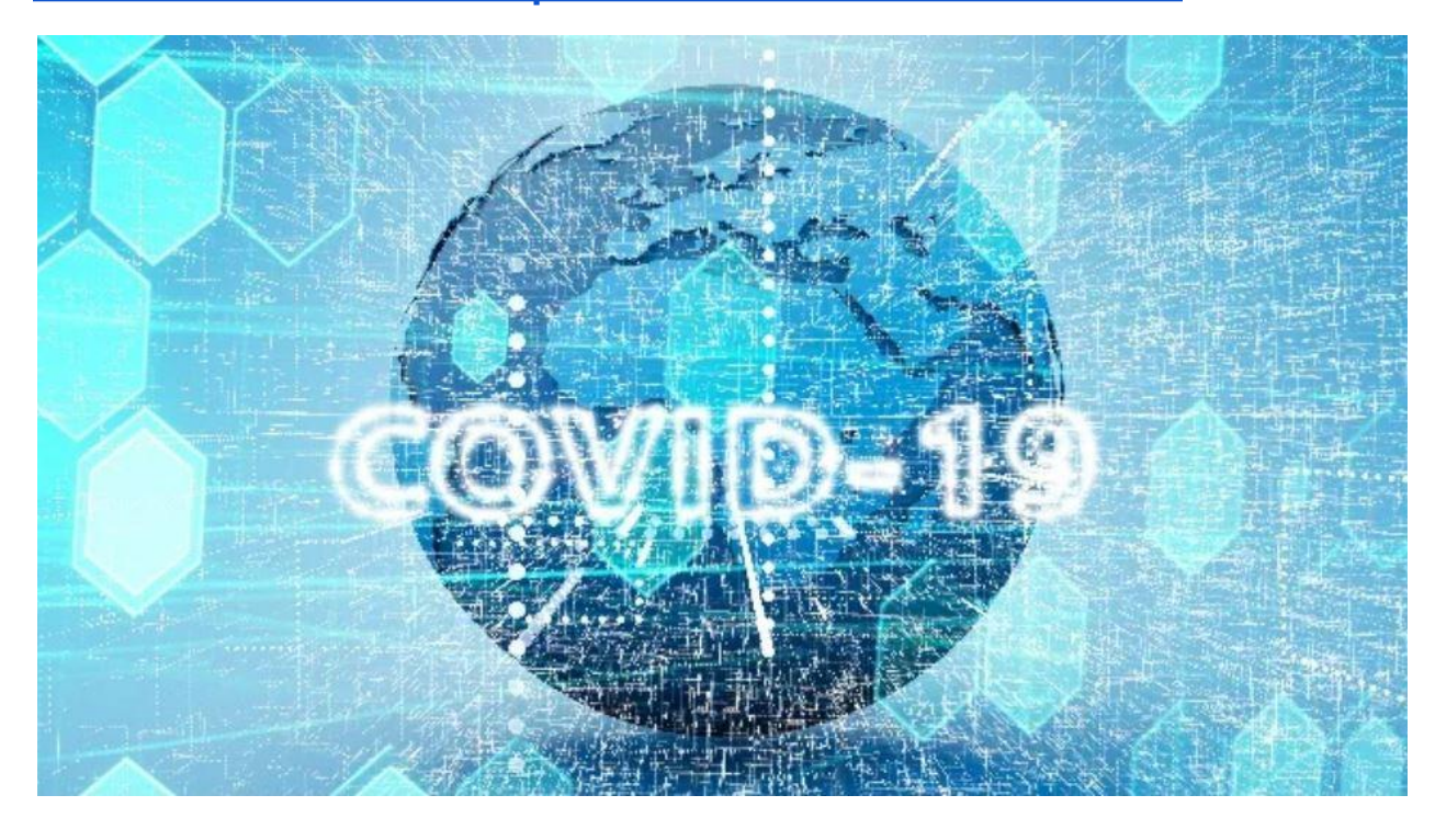
COVID-19 Vaccine Development: An Interview With GeoVax