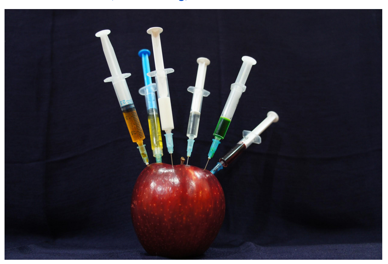
A COVID-19 Vaccine, Outsourcing, And Made In The USA